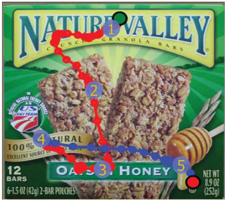
Figure 2: Analysis must be broken down into thin slices to obtain an accurate reading of what the eye movements indicate.

A quantitative interpretation of eye-tracking data requires a working knowledge of statistical analysis and a full understanding of the many ways that eye data can be scrutinized. It starts with the initial setup of the study. If you are interested in learning how much visual attention is allocated to a logo in a commercial or a product shot on a package,