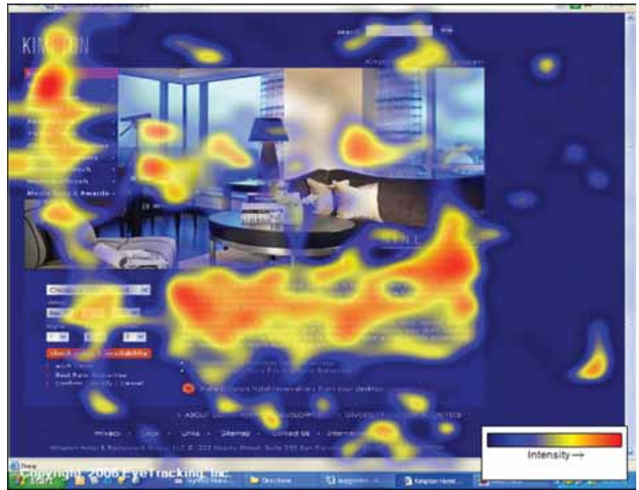
Figure 1: Analyzing the heat map won't give you the full picture of a viewer's experience with and reaction to a Web page.

Take a look at Figure 1, which shows the visual attention to a Web page. What does this tell you? Is the Web site successful? Do people understand the content? Can a new user find what they are looking for quickly? What features cause confu-